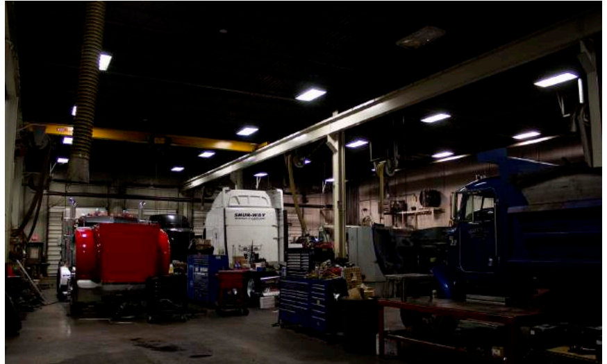
230W PHOENIX LED HIGHBAYS INSTALLED (5,000K Version)