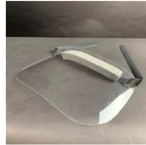
Flat. Easy for stacking, storing, packing, and shipping