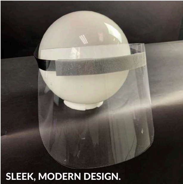
SLEEK, MODERN DESIGN.