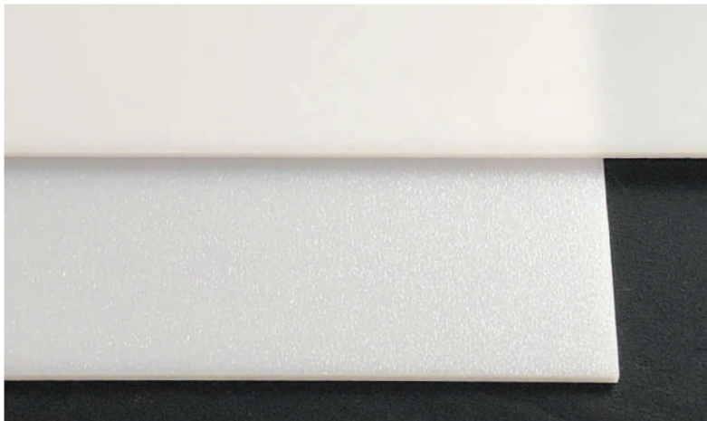
Pattern 21 Smooth Finish (top) & Pattern 21 Textured Finish (bottom)