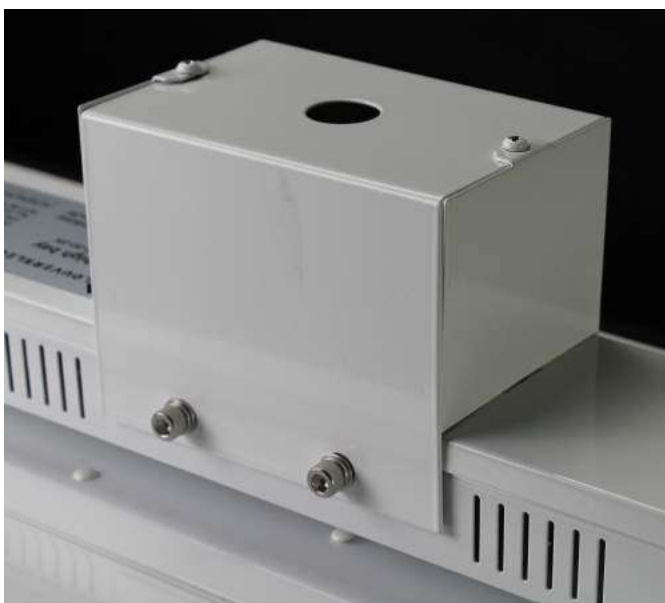
STEM / SURFACE MOUNT BOX DETAIL