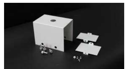
STEM / SURFACE MOUNT BOX DISASSEMBLED