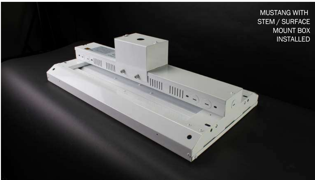
MUSTANG WITH STEM / SURFACE MOUNT BOX INSTALLED

V-Clips for dual point chain or cable hanging.