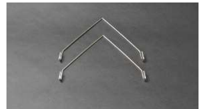
V - HOOKS